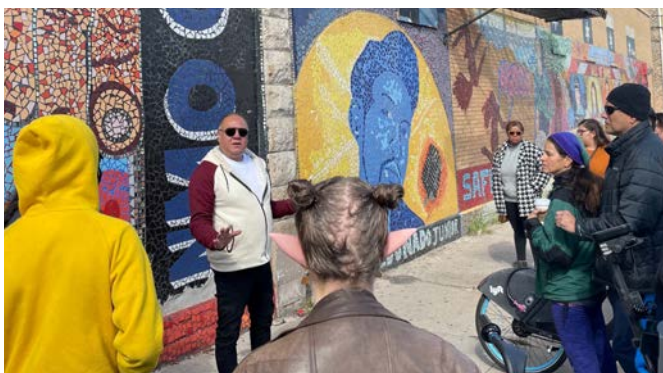
Skills staff at the Neighborhood Mural Walk in Chicago's Pilsen neighborhood.

Our staff members are encouraged to participate and share their unique views at all VOS events.