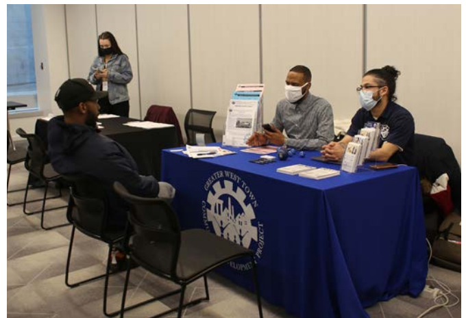
A job seeker talks with Greater West Town Project, one of our community partners, during our Spring Hiring Fair which took place at our Chicago Loop location on March 22, 2022.