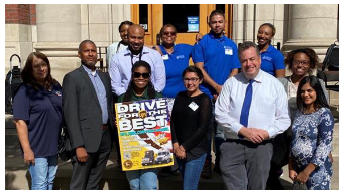
Skills staff along with hiring partners at an Englewood community event on August 17, 2022.