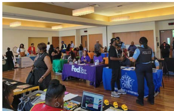
The CBO welcomed job seekers and community partners at their Southside Hiring Event on July 21, 2022.