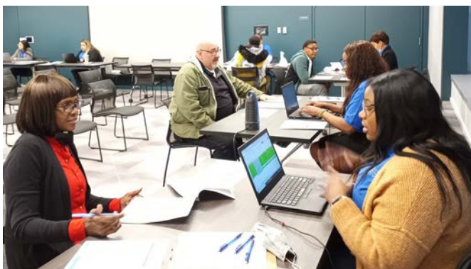
A candidate interviews with a Skills Talent Acquisition staff member during our Spring Hiring Fair which was held at our Chicago Loop location on March 22, 2022.