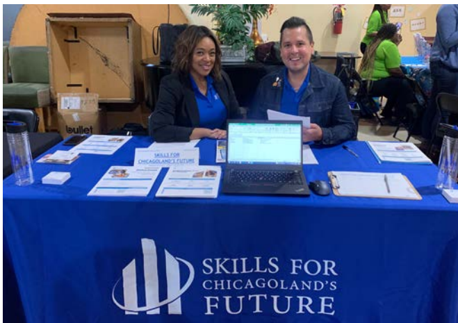
Skills staff participating in the St. Sabina Career Fair on September 22, 2022.

Our Community & Strategic Partnerships team dedicated their efforts in 2022 to deepening engagement with our network of local workforce partners and generating more efficient and effective candidate journeys. In 2022, the number of candidates hired through referrals increased through an optimized process. Our team is also growing our community partnerships in South and West Side neighborhoods, working with partners located in the community to better serve local talent. Currently, Skills has staff co-located with two local partners in Englewood and North Lawndale.