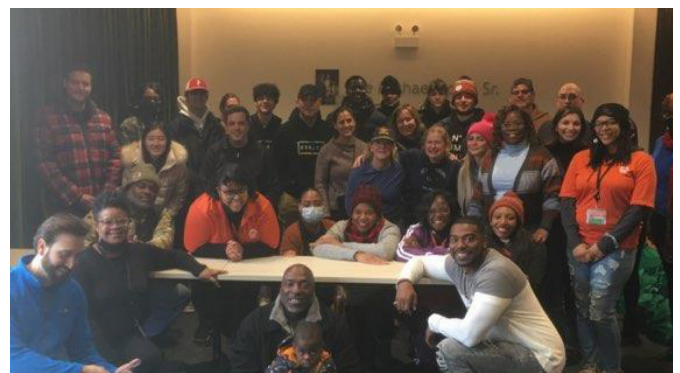
Skills staff and volunteers at North Lawndale Employment Network's Thanksgiving volunteer event.