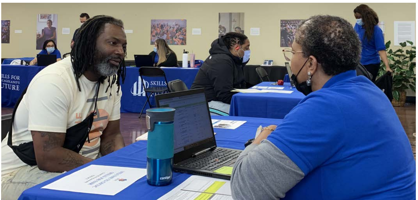
A job seeker interviews with a Skills Talent Acquisition staff member at a job fair at our south side Neighborhood Link location.